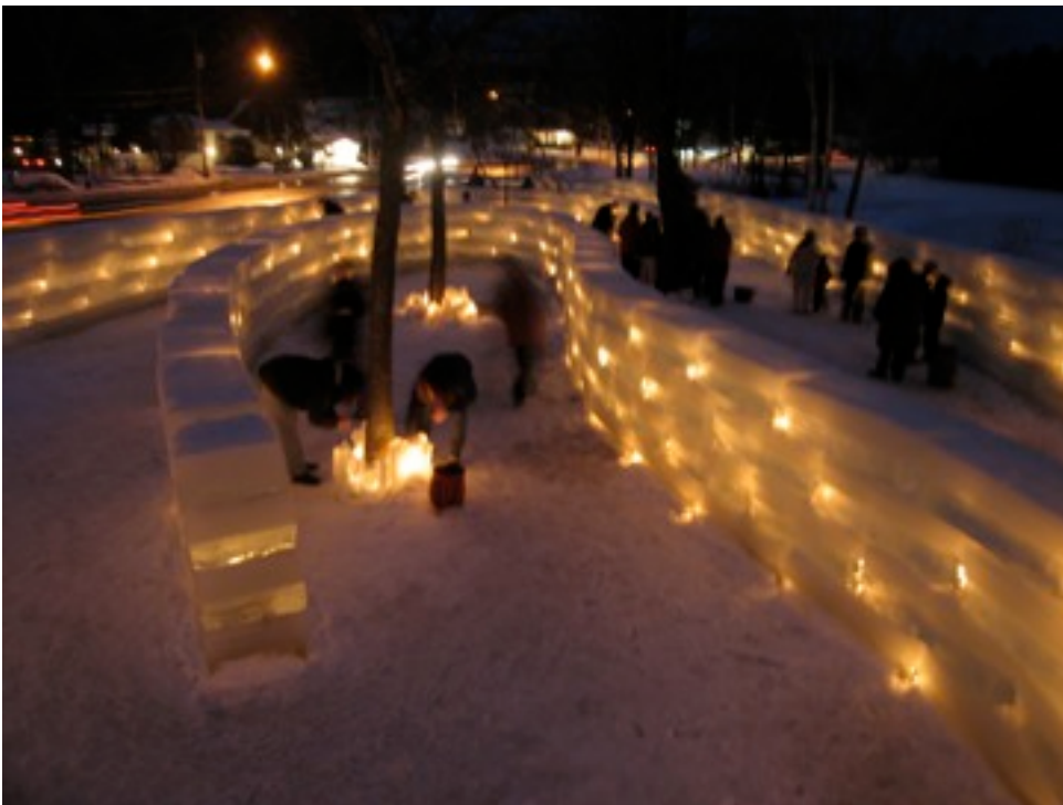
Community Spiral (Saranac Lake 2008)

1200 candles lit and placed into pockets in snowpack