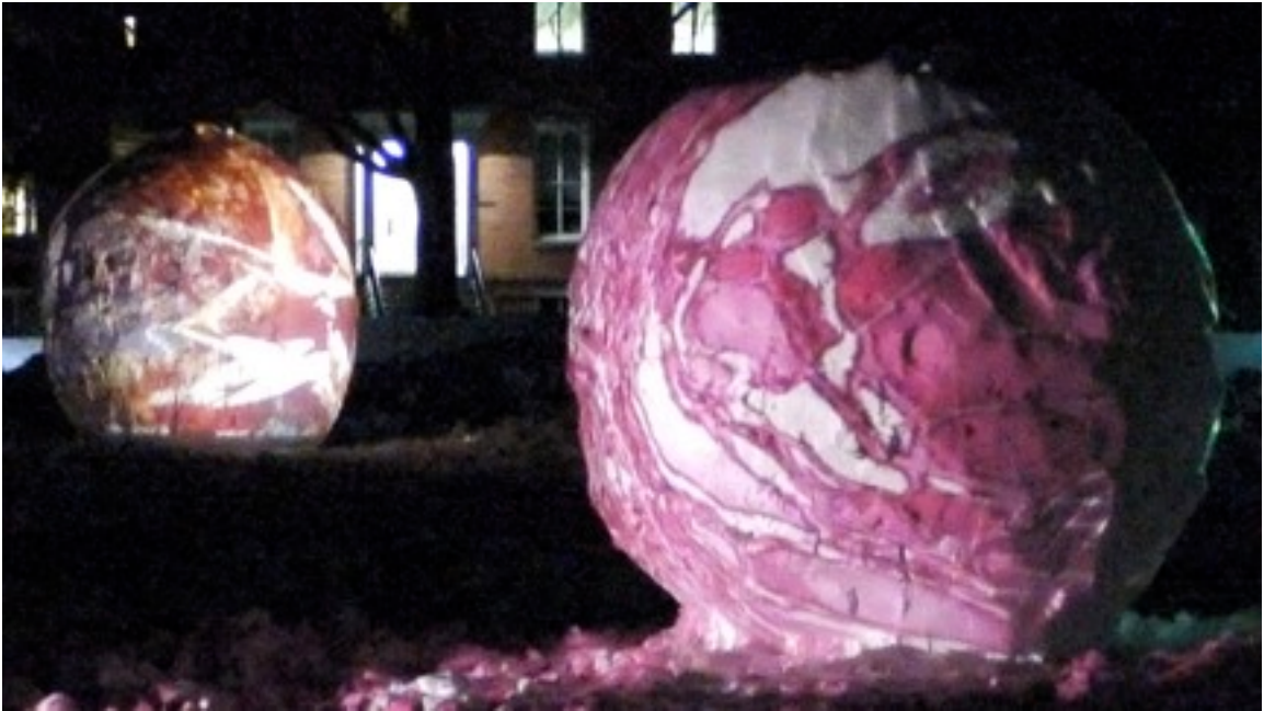
E-Lumination 2011 (St. Lawrence U)