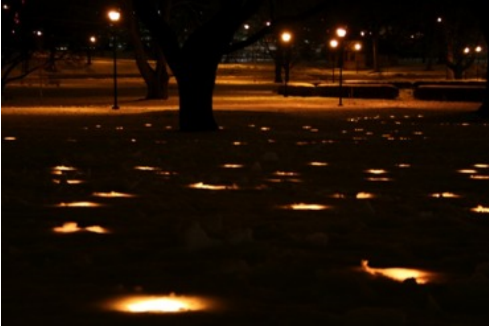
Deering Park Illumination (Portland, 2006)

1200 candles lit and placed into pockets in snowpack